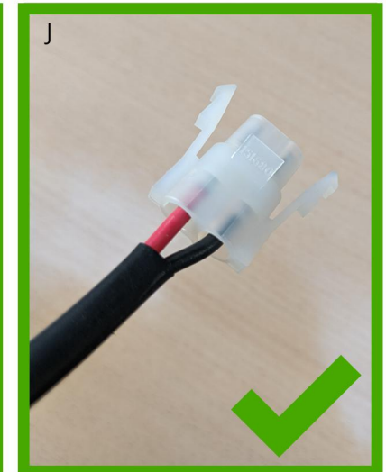
(G - J) Multiple angles of the connector are needed to help determine the correct connector. (J) A clear photo of how the wires, from the battery, fit into the connector is important to ensure correct polarity.