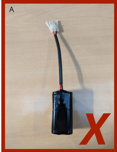
(A) Make sure the full shape of the battery pack can be determined

We require clear photographs of the overall battery pack, labelling and termination (Connector / Flying leads).