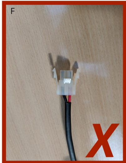
(F) Multiple photos of the connector are required