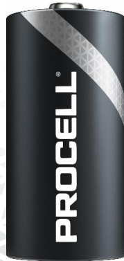
Size: C (LR14) PC1400