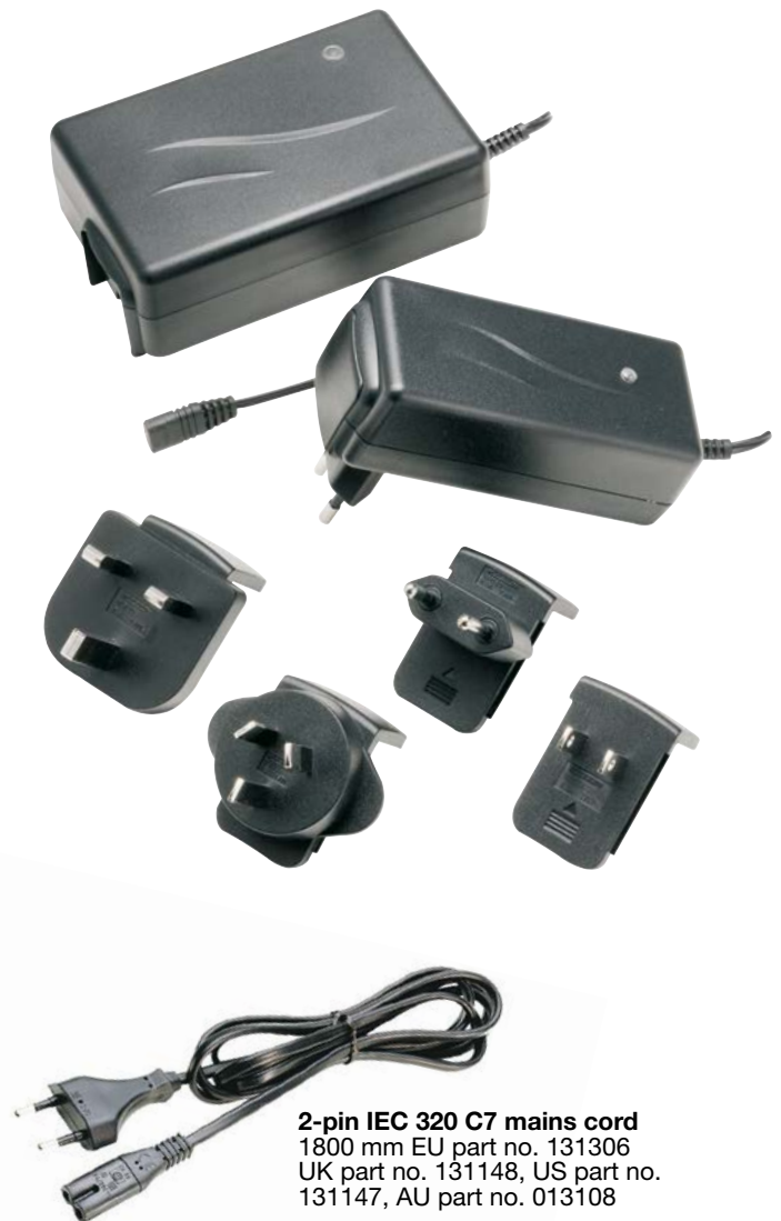
2-pin IEC 320 C7 mains cord 1800 mm EU part no. 131306 UK part no. 131148, US part no. 131147, AU part no. 013108