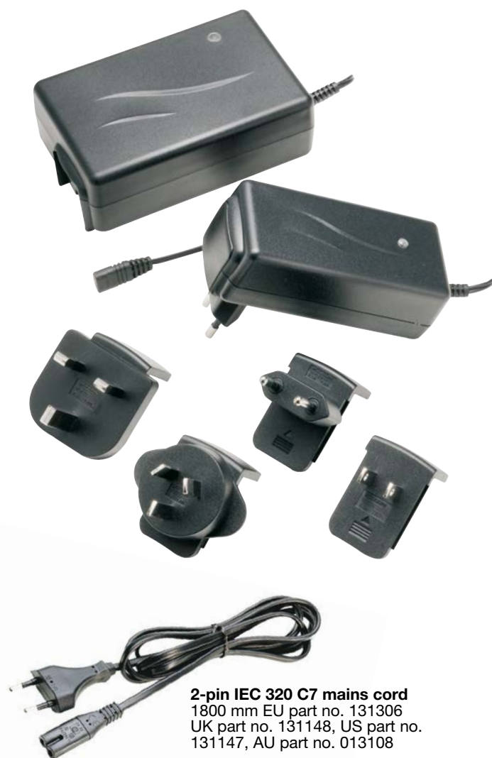
2-pin IEC 320 C7 mains cord 1800 mm EU part no. 131306 UK part no. 131148, US part no. 131147, AU part no. 013108